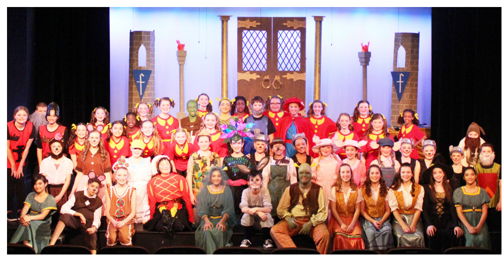
Lincoln Middle School's musical production of Shrek Jr. received a School Award on behalf of Rainbow Stage.

At the Middle Years level, Lincoln Middle School earned one of two $750 Rainbow Stage Performance Awards presented in Manitoba. The school brought Shrek Jr. to life and received its second consecutive School Award from Rainbow Stage. Congratulations to both schools on the fantastic shows!