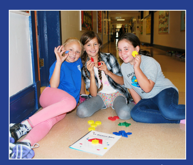
Problem solving solutions at École Assiniboine Page 3