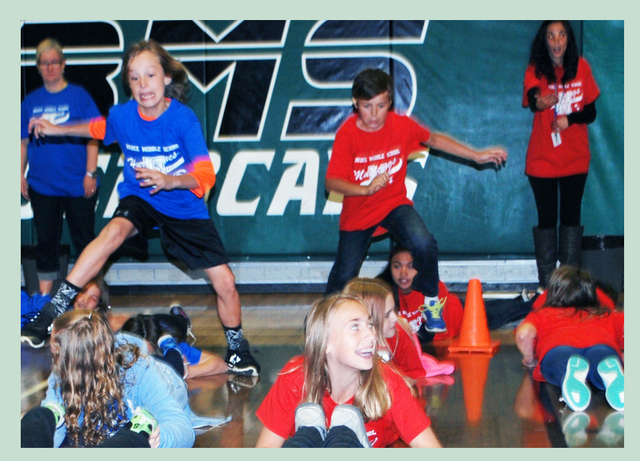
Two of the four B.LA.S.T. teams caught in the middle of the caterpillar activity inside the gym at Bruce Middle School.