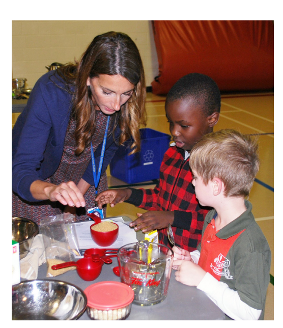
Learning how to make couscous one step