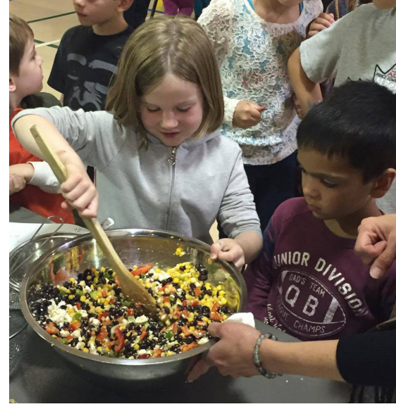
Final step: stirring the couscous salad.