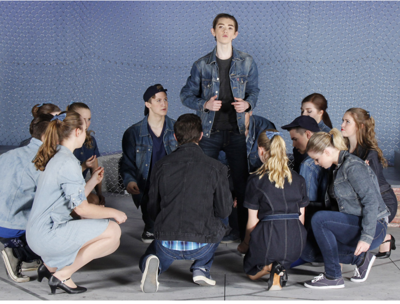
The favourite classic West Side Story performed last year at Westwood Collegiate earned the school its fifth consecutive Rainbow Stage Award.

Over the past decade, many exceptional ideas and leading initiatives have been introduced in our schools in response to the content shared at the youth forum. Each year, students and staff members create a pledge saying how they plan to make a change this year and post their statement onto a commitment poster. This year's commitment poster, which hung on the wall at the event outlining the number 10, is an exciting sign that we can expect more innnovative movements and acts of kindness within our schools in the coming year.